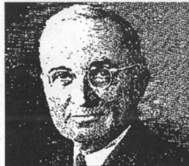
Harry S. Truman 1945 - 1953

417 N. Pearl Street Centralia, Washington 98531