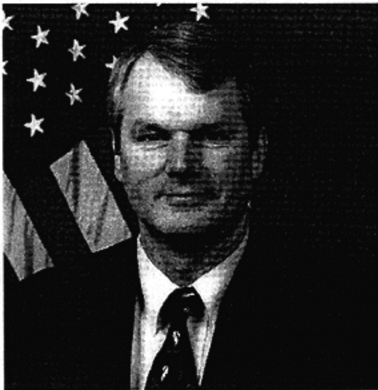
Brian Baird, our Democratic Congressman