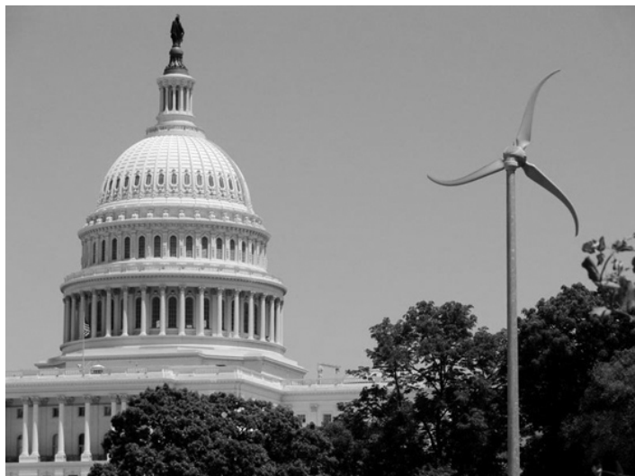
Wind power being utilized in Washington D.C.

Tidal power is another area being studied in Pacific County in a partnership with the PUD and a private company. I recently had the pleasure of attending a tidal power conference in Seattle where a UK trade mission made a presentation. They have